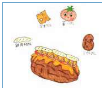
The name of meal: Baked Potato with Tomato, Chicken and Cheese

2D Wong Pui Ching Leung Kui Kau Lutheran Primary School