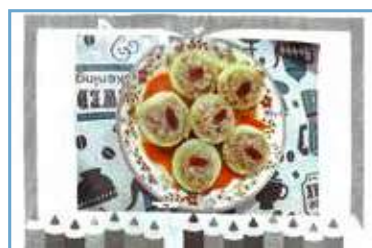
The name of meal: Stuffed Hairy Squash with Minced Pork

1D Lee Tung Yee Leung Kui Kau Lutheran Primary School