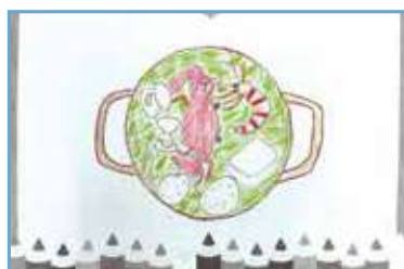
The name of meal: Anhydrous Seafood Pot

1D Lee Tung Yee Leung Kui Kau Lutheran Primary School