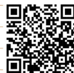
Let's appreciate the masterpieces from Water Saving Week

The award list of "Cherish Water Campus" Integrated Education Programme - Primary School (school year 2021/22) has been released.