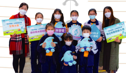
The Grand Champion & Gold Award (Sha Tin District) of "Cherish Water Campus" 2021/22 — Chi Hong Primary School