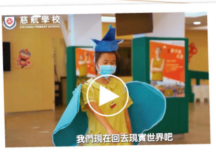
The Winning Entry of Promotional Video Contest — 《吓！一齊去左冇水嘅世界！》